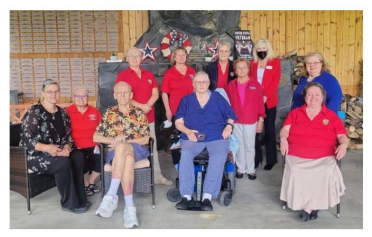
Anchorage Senior Center

Department of Alaska enjoying veterans and family as they receive new furniture purchased with ALA Foundation grant. Having the new furniture, one U.S. navy veteran states gaining new experiences, support, and camaraderie.