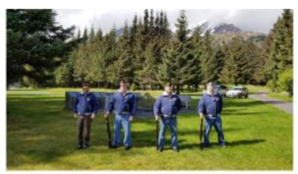
Seward Unit 5- Firing Squad for Memorial Day Service