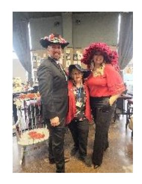
Hats modeled by Our dignitaries

Units reported 890 hours; 14 volunteers and $2,500.00 collected.