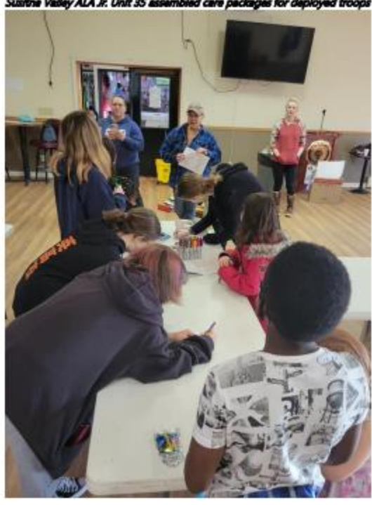
Susitne Valley ALA Jr. Unit 35 assembled care packages for deployed troop