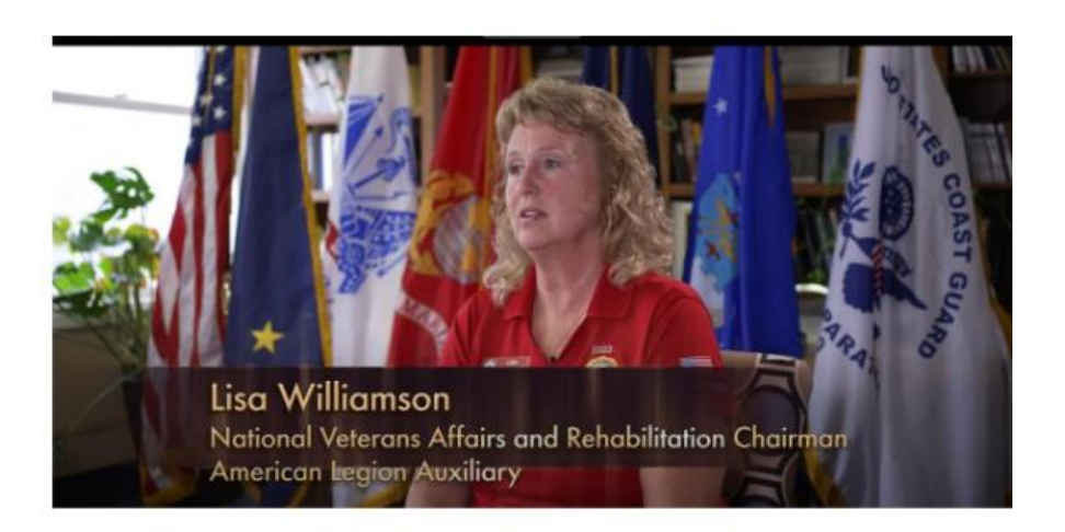
YouTube clip — Thanking ALL Veterans for their service on Veterans Day & Every day.