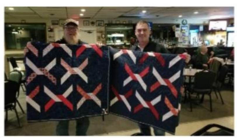
Quilts of Valor